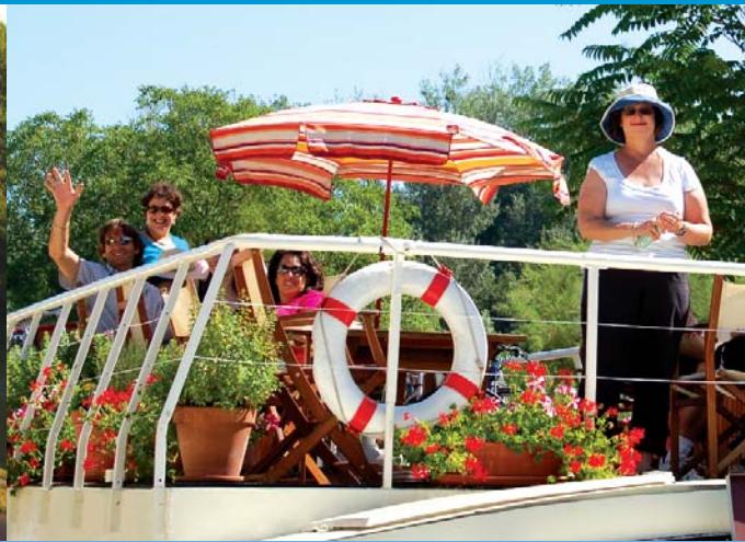
BURGUNDY EXPLORED - CRUISING ON THE LUCIOLE