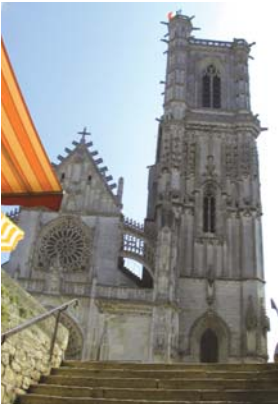
Top: our bus arrives in Paris for the transfer to the Luciole. Above: the church of St Martin in Clamecy Below: Noyers-sur-Serein; barrels of Chablis; the Chateau of Bazoches. Opposite Page: vineyards at Irancy; ramparts at Vézelay; mooring in Auxerre.