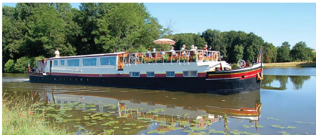
The Luciole, 'Le Tricolore' of France, Pousseaux and dawn at Châtel-Censoir. Opposite: Life on board and in the picturesque centre of Auxerre.

Our weekly all-inclusive fares cover six nights accommodation, all meals and wine served on board, together with drinks from our open bar. Use of the barge's bus for local excursions is also provided, under the direction of the Captain and our tour guide. Rates also include our scheduled bus transfer to the Luciole from Paris and the return journey.